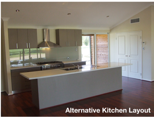
Alternative Kitchen Layout