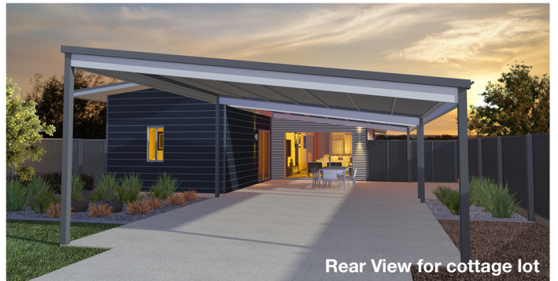
Rear View for cottage lot