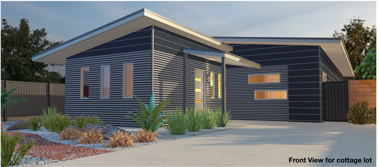
Front View for cottage lot