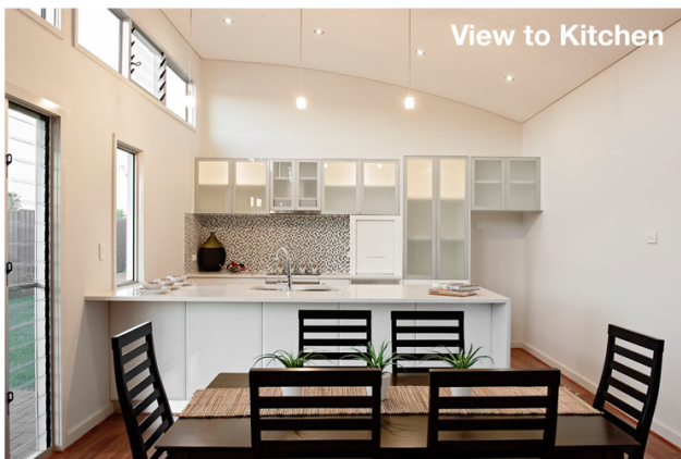
View to Kitchen