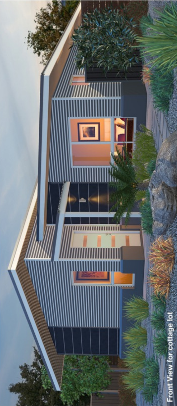
Front View for cottage lot